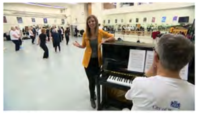
BBC London: Silver Sundays